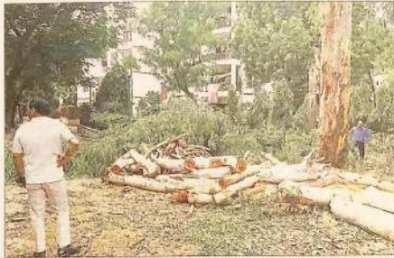
A passerby spotted some trees being felled inside the National Council of Educational Research and Training campus and informed a tree activist.