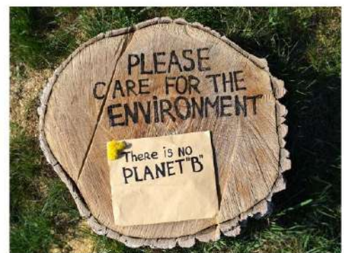
Save trees!