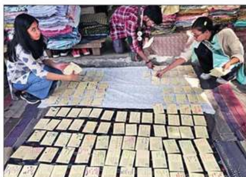
GREEN LETTER DAY