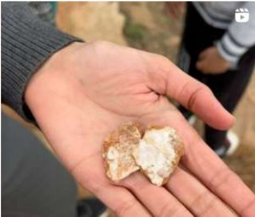
Transparent layers of Mica crystals found under Delhi