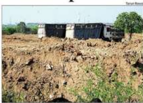
Landscaping being done at the floodplain area near Shastrri Park.

Experts, however, pointed out that the work violated the 2015 National Green Tribunal (NGT) judgment in the case of Manoj Mishra versus Union of India, Delhi govt and others , which had set the guidelines to be followed to protect the Yamuna and its floodplain. "No filling of the flood-