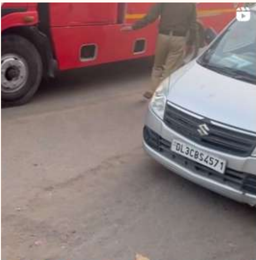
If you see something, you should do something. Delhi Fire Service save the day!