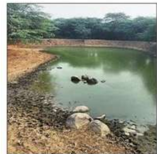
The move is likely to conserve at least 8 lakh crore litres of water by monsoon-end

“Giving the original or historic name to an improvised or refurbished pond also increases a sense of responsibility. We thus decided to name those ponds what they used to be called. In this series, we got names like Gummar Talab, Boru Talab, Nava Talab, Pulia Talab etc.”