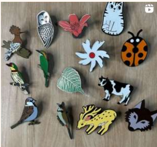
New Lapel Pin out right now! Which are your favourite?