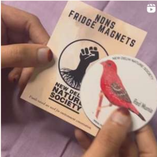
New fridge magnets available for purchase!