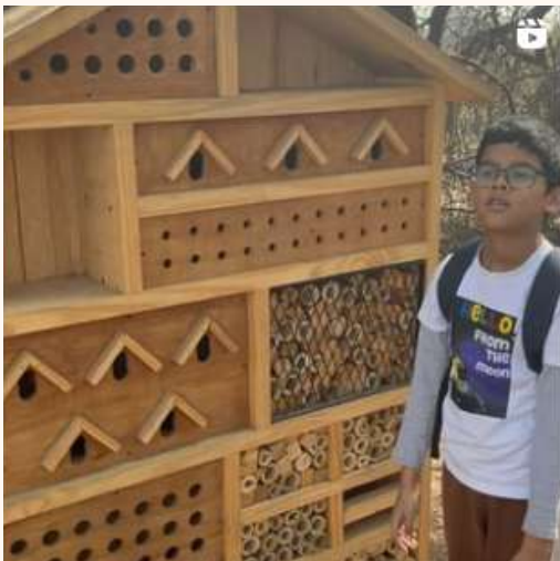
Insect Hotel DIY