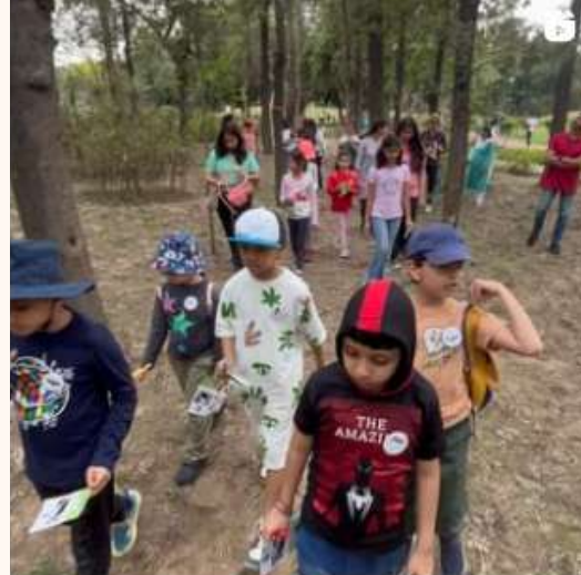
Birthday in nature!