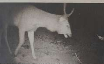
Sambar deer is usually confined to dense forests

The animal is native to the Indian subcontinent and is usually confined to very dense forests. Hence, its sighting near human habitat is very rare. In February, a sambar deer was spotted in Mangar Bani.