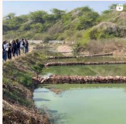
Nature walk with IIAD design students, pt.2