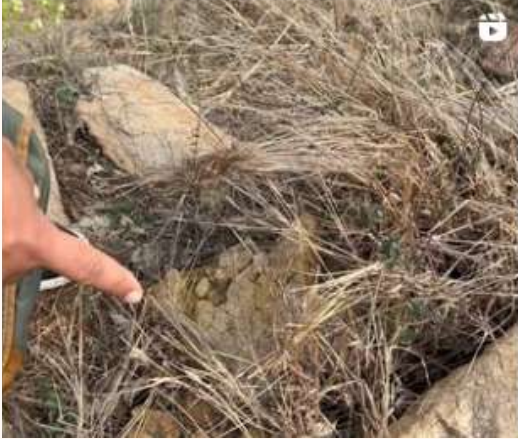
Untangling the mystery of Spear Grass.