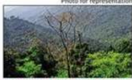
Photo for representation PROTECTING WESTERN GHATS

The transmission line was aligned to pass through three Karnataka districts — Dharwad, Belagavi and Uttara Kannada — before reaching south Goa.