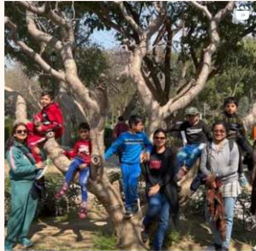
Playdate @ Nehru Park