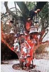
Kareel tree. Also called leafless caper berry in English and Tenti and Karira in Hindi

The board has already released a book on heritage trees, with a personalised note on each tree, which is meant to create a public connection with these trees. There is a 100-year-old Kareel tree in govt