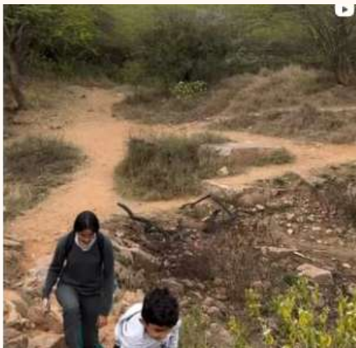
Nature Walk @ Sanjay Van