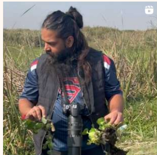
How does Hyacinth float?