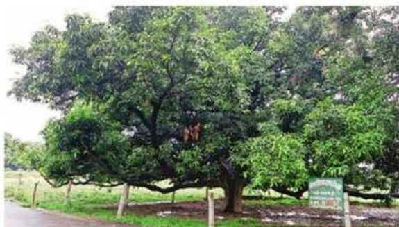
Mother tree of Dussehri mango in Kakori, Lucknow. Aged about 200 yrs

Mother tree of Dussehri mango in Lucknow’s Kakori tehsil, an imli tree in Fatehpur on which 52 revolutionaries were hanged during freedom struggle and mother tree of langda mango on a court premises in Varanasi are others mentioned in the board’s records. State govt had issued a GO to notify heritage trees in UP in Nov 2019. Heritage trees should exist only on govt or community land and not on forest and private land.