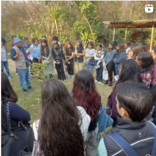
Nature walk with IIAD design students, pt. 1