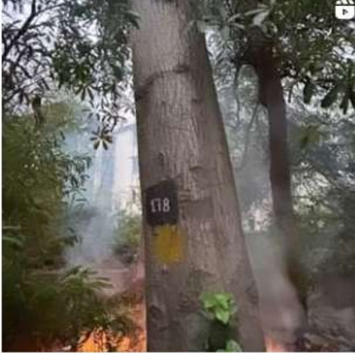
Help Delhiites to live healthier happier lives.